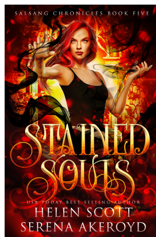
Stained Souls - Book 5 in the Salsang Chronicles

Find out in STAINED SOULS, the final part of the Salsang Chronicles.