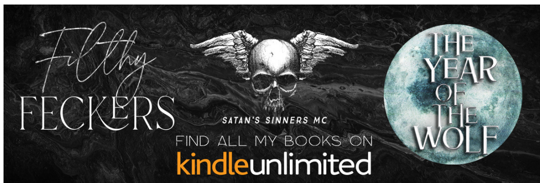
Find all my books on Kindle Unlimited