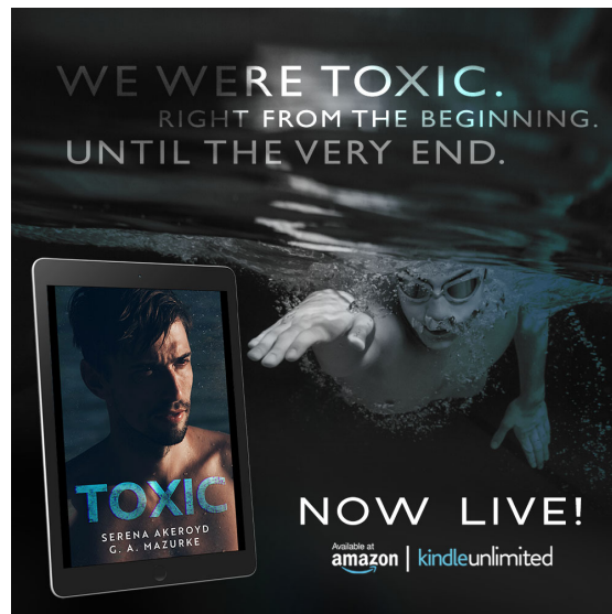
TOXIC for 99 cents!