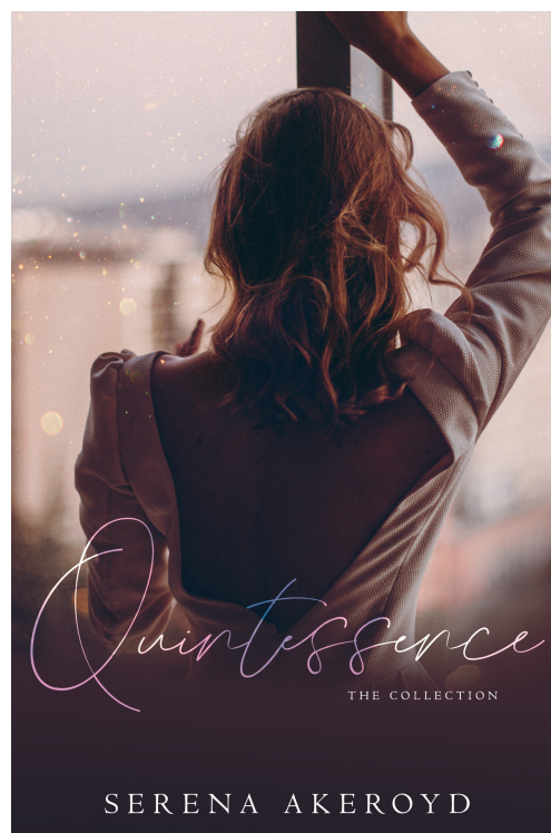
Quintessence : The Collection

I will be putting Hers To Keep , Theirs To Cherish and Hers To Hold in one big ebook! And I will be adding all the extra content that I had previously posted on my reader group, plus close to 10K words of new content!