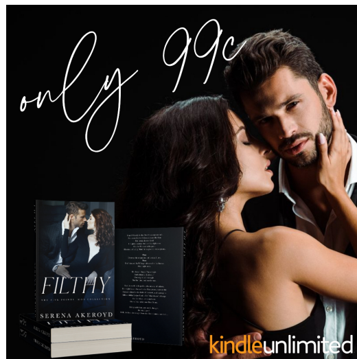
Filthy for 99 cents!