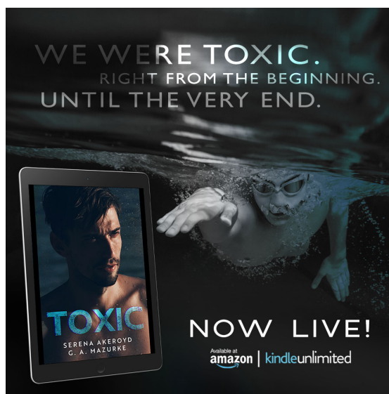
TOXIC for 99 cents!