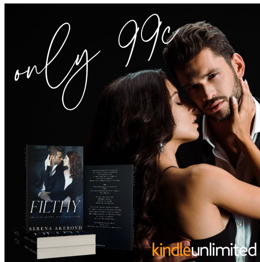
Filthy for 99 cents!