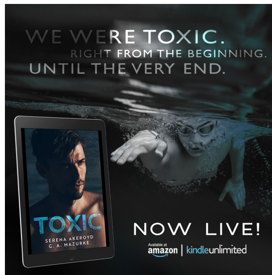
TOXIC for 99 cents!