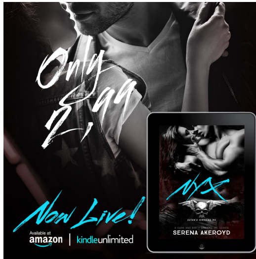
Nyx on sale for 2,99!