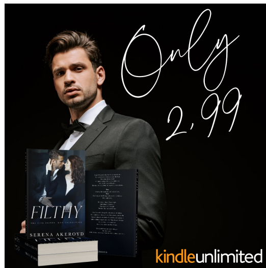
Filthy on sale for 2,99!