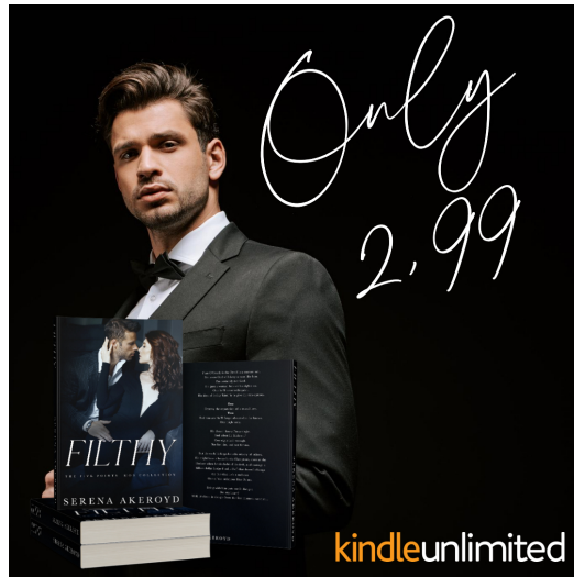
Filthy for 2,99!