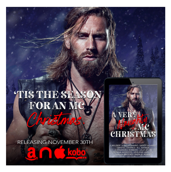
ONLY 99 PENNIES!