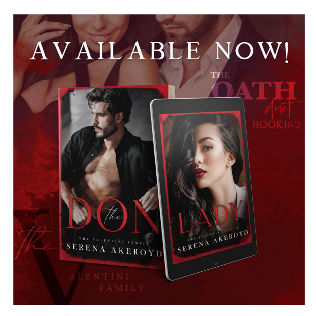
The DON now LIVE And FREE to read in KU!