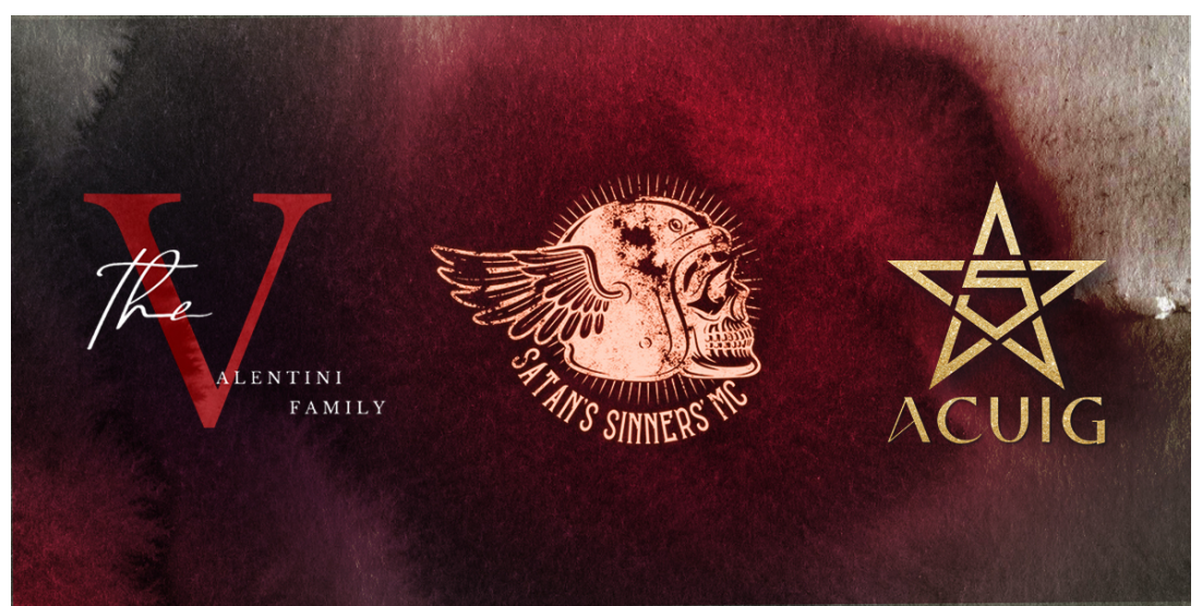
Find all my books on Kindle Unlimited

For the inside scoop, giveaways, and sneak peeks at what's coming up next!