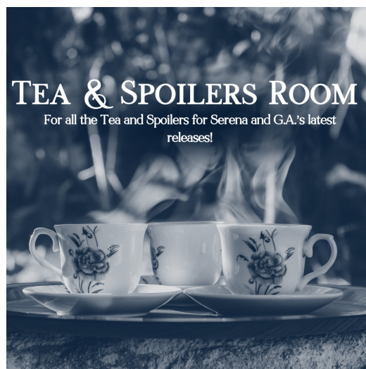
Serena and G.A.'s spoilers group on Facebook!